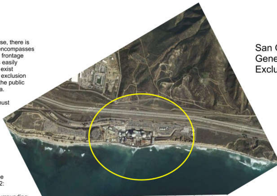
San Onofre Nuclear Generating Station Exclusion Zone

Exclusion area means that area surrounding the reactor, in which the reactor licensee has the authority to determine all activities including exclusion or removal of personnel and property from the area. This area may be traversed by a highway, railroad, or waterway, provided these are not so close to the facility as to interfere with normal operations of the facility and provided appropriate and effective arrangements are made to control traffic on the highway, railroad, or waterway, in case of emergency, to protect the public health and safety. Residence within the exclusion area shall normally be prohibited. In any event, residents shall be subject to ready removal in case of necessity. Activities unrelated to operation of the reactor may be permitted in an exclusion area under appropriate limitations, provided that no significant hazards to the public health and safety will result.