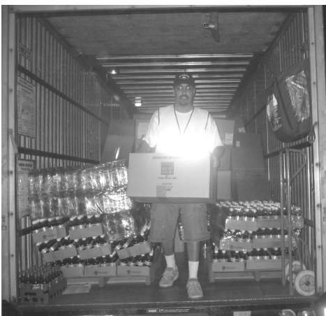
Potrero VFD volunteer wearing Blackwater hat carries boxed relief to sustain a family of four for four days as truck is unloaded in Potrero.

This shortage of relief supplies in Potrero was quite remarkable since other areas had long completed distributing their supplies. One could only wonder if the shortage allowed to continue so Blackwater could become the valiant white knight saving the town from the ravages of the disaster, indeed just days prior to the mailing of the ballots in the