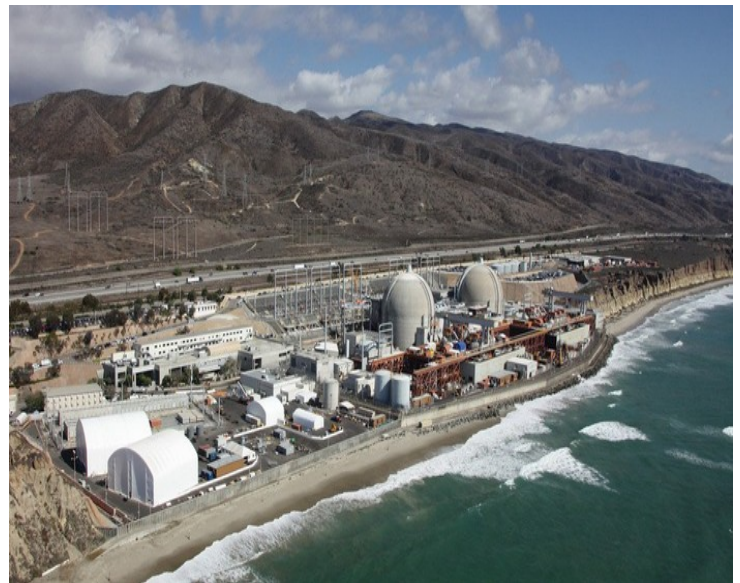
San Onofre Nuclear Generating Station (SONGS)

Still in full meltdown after March 11, 2011 disaster.